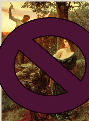
“Damsel in Distress”

Also avoid common terms that could be considered offensive