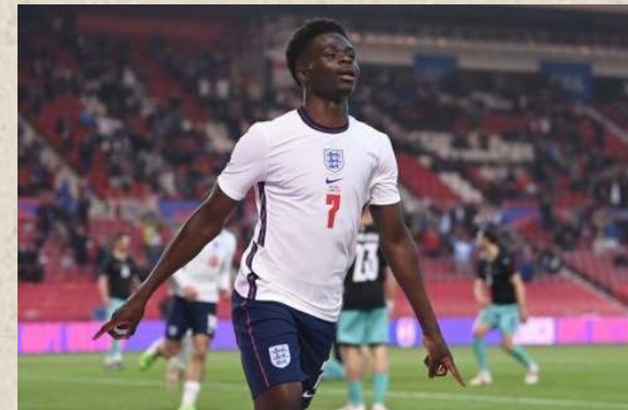
Bukayo Saka: Not African American (Nigerian-Englishmen)

These two pictured athletes are both Black men, but they are NOT both African American