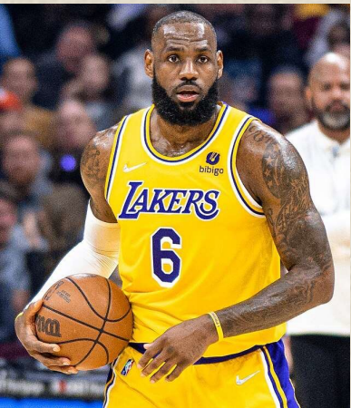
Lebron James: African American

These two pictured athletes are both Black men, but they are NOT both African American